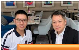
Master and Apprentice

The Hong Kong Gifted Apprentice Programme (HKGAP) is a 2-year & unique mentorship programme of the Hong Kong Academy for Gifted Education (HKAGE) with generous supports from Masters who are leaders and experts from education, business, health, legal, political and other professional sectors.