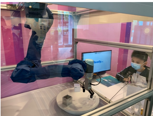
Voice Control Robotic Arm