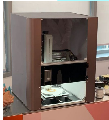
Robotic Kitchen for Elderly