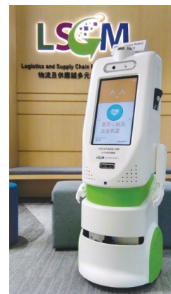
Smart Service Robot