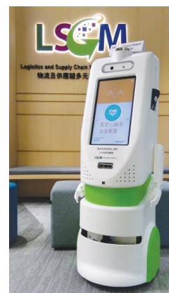
Smart Service Robot