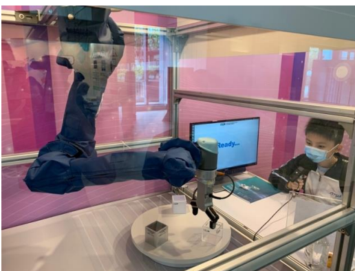
Voice Control Robotic Arm