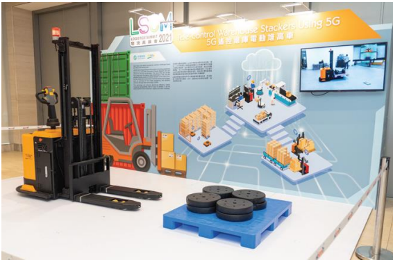
Tele-Control Warehouse Stackers Using 5G