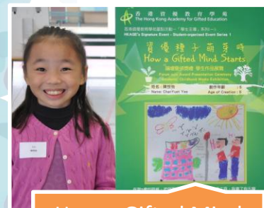
How a Gifted Mind Starts