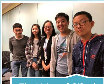
The Voice of Gifted Learners