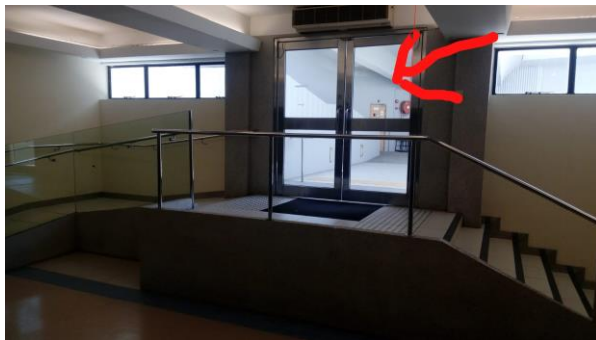
Lift hall of 2/F, North Block.