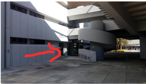
Outside the entrance of North Block.

SC_L4: Pls enter the building at the North Block (Charles Kuen Kao Building) (科學館北座／高錕樓), go to 2/F, and then the Middle Block . Note that you cannot reach 2/F of the Middle Block from outside directly. You must get into the building first.