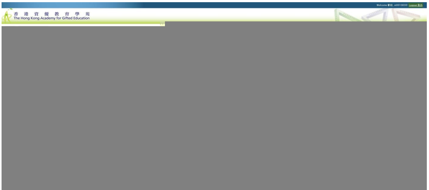
Figure 3 - User Profile

The user can change his/her name, email and password at the My Account page (See Figure 3). Click “Update” to save the changes.